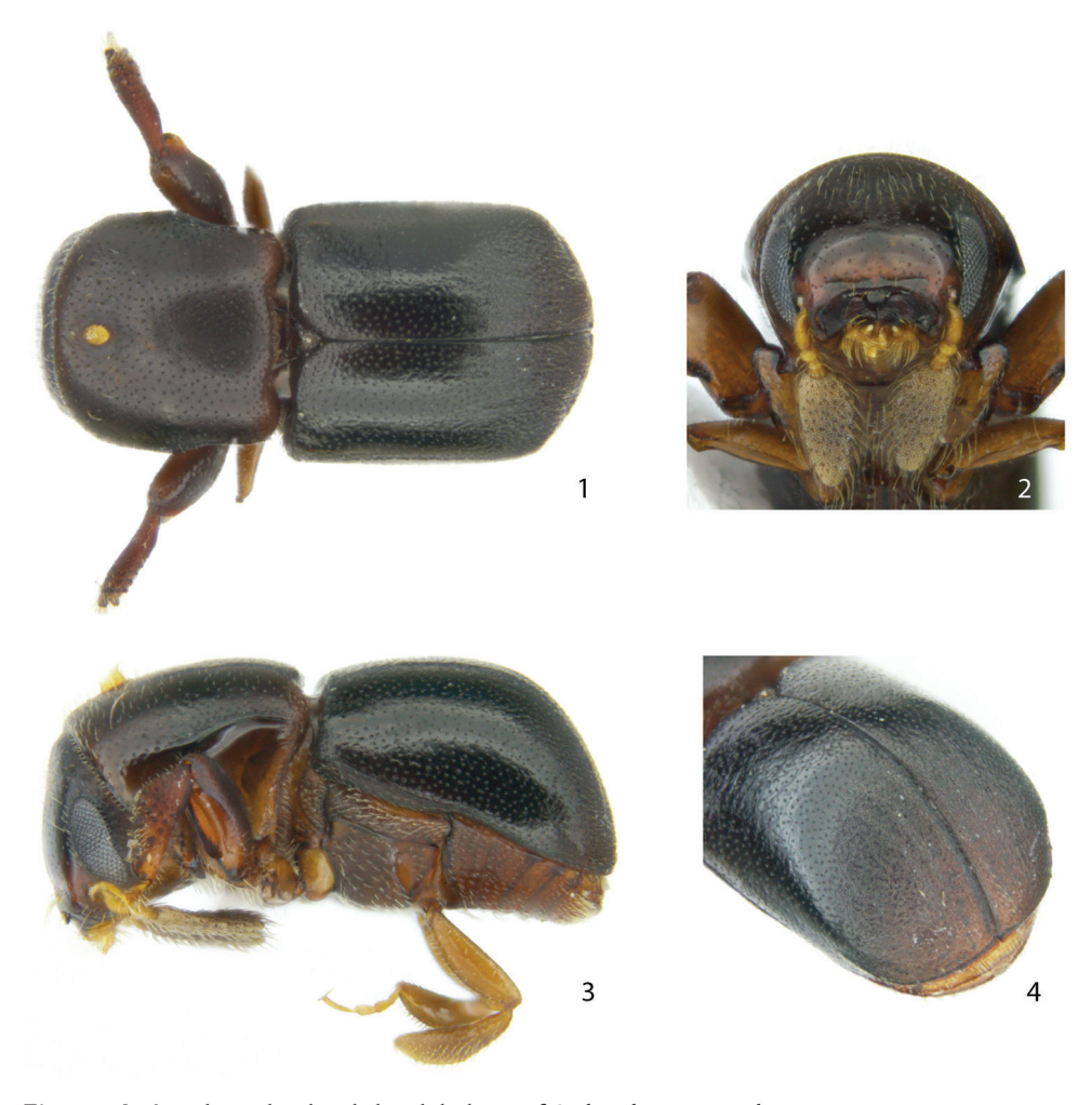
Figures 1-4. Habitus, head and elytral declivity of Scolytoplatypus unipilus sp. n.

("ZMBN/ENTScol4942 – ZMBN/ENTScol4944") are deposited in the University Museum of Bergen (ZMBN).